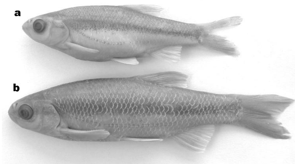
Figure 1. Pseudophoxinus alii , paratypes, SCFK-SDU/169; female 53.0 mm SL, male 69.55 mm SL. Ilica stream, Manavgat, Antalya, Turkey (a: female, b: male).

depth at nape 69%-89% HL; predorsal vertebrae 13-15, commonly 14, comprising 59%-63% of abdominal vertebrae count, pelvic fins origin in front of the dorsal fin origin. Sexual dimorphism is pronounced; spawning males are generally darker and possess nuptial tubercles on dorsal and lateral surface of the head and along rays of the pectoral fin.